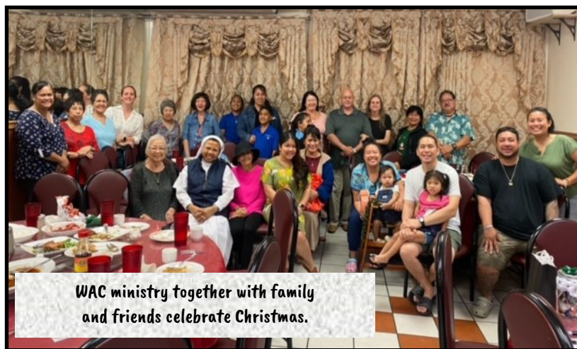
WAC ministry together with family and friends celebrate Christmas.