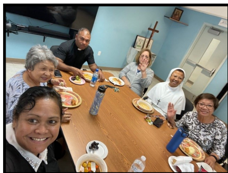
Bereavement Committee Christmas Celebration